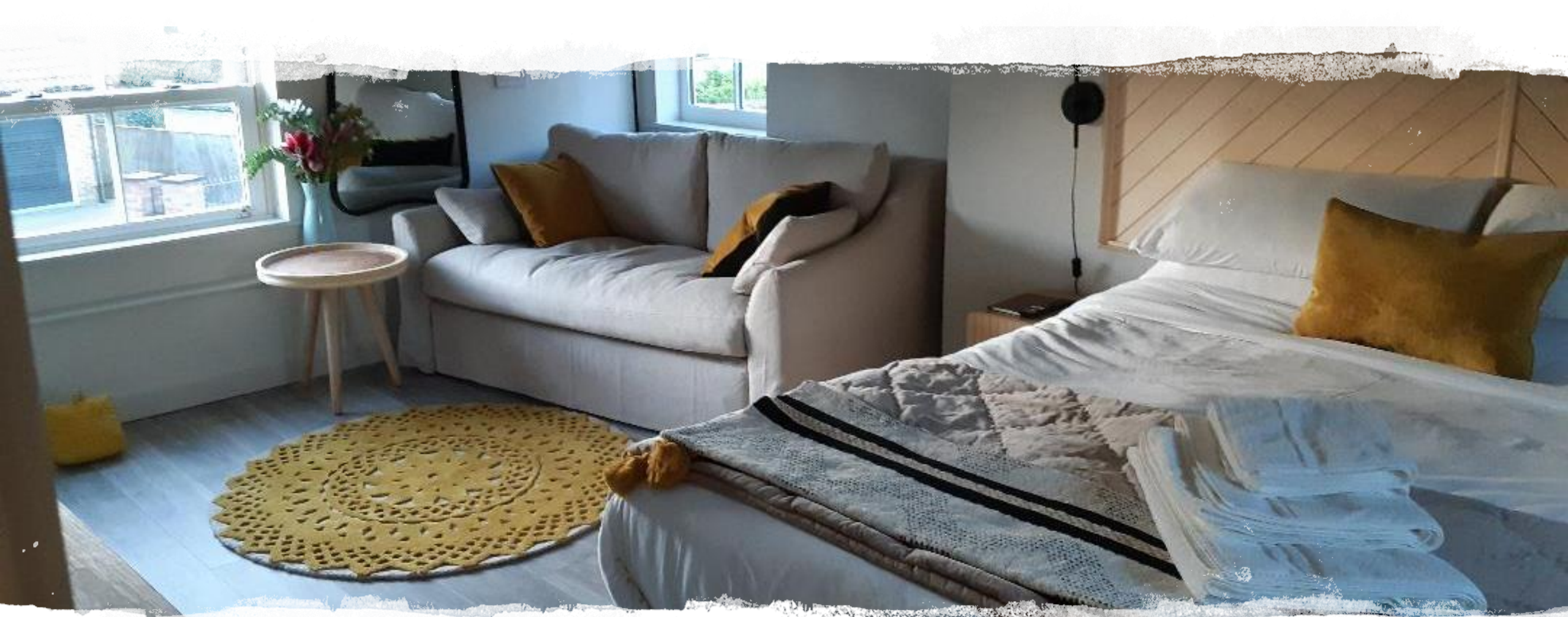
Bed and Breakfast rooms