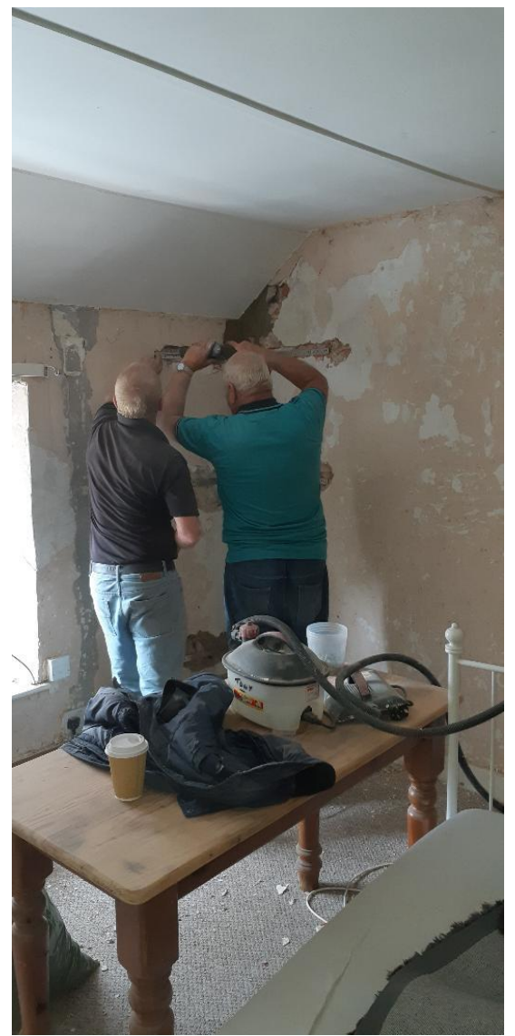
Bed and breakfast rooms